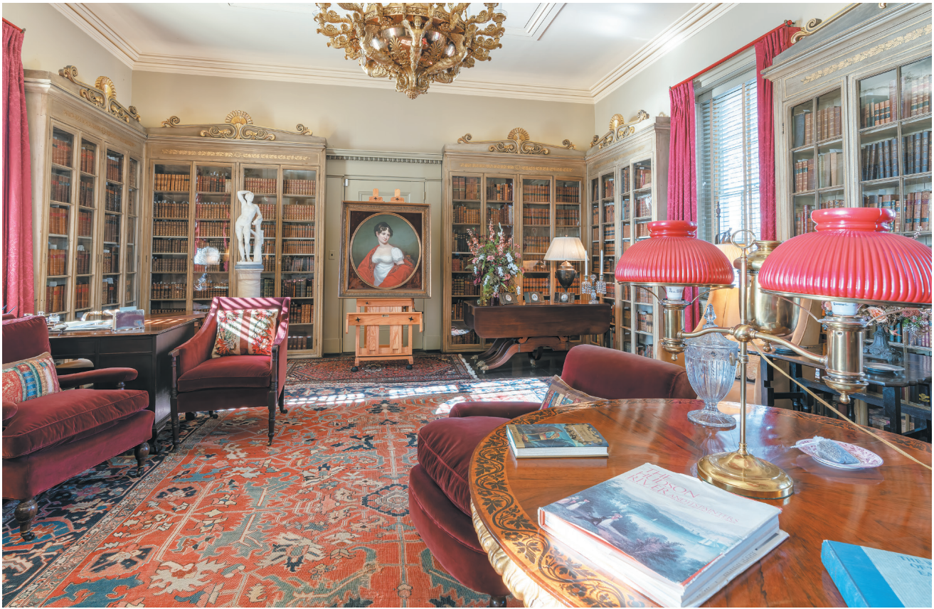
The library at Andalusia.

the vision put forward in the book. The two, the book and the building, are, in a way, a pair. The building is the incarnation of both the dream and direction the book puts forth.